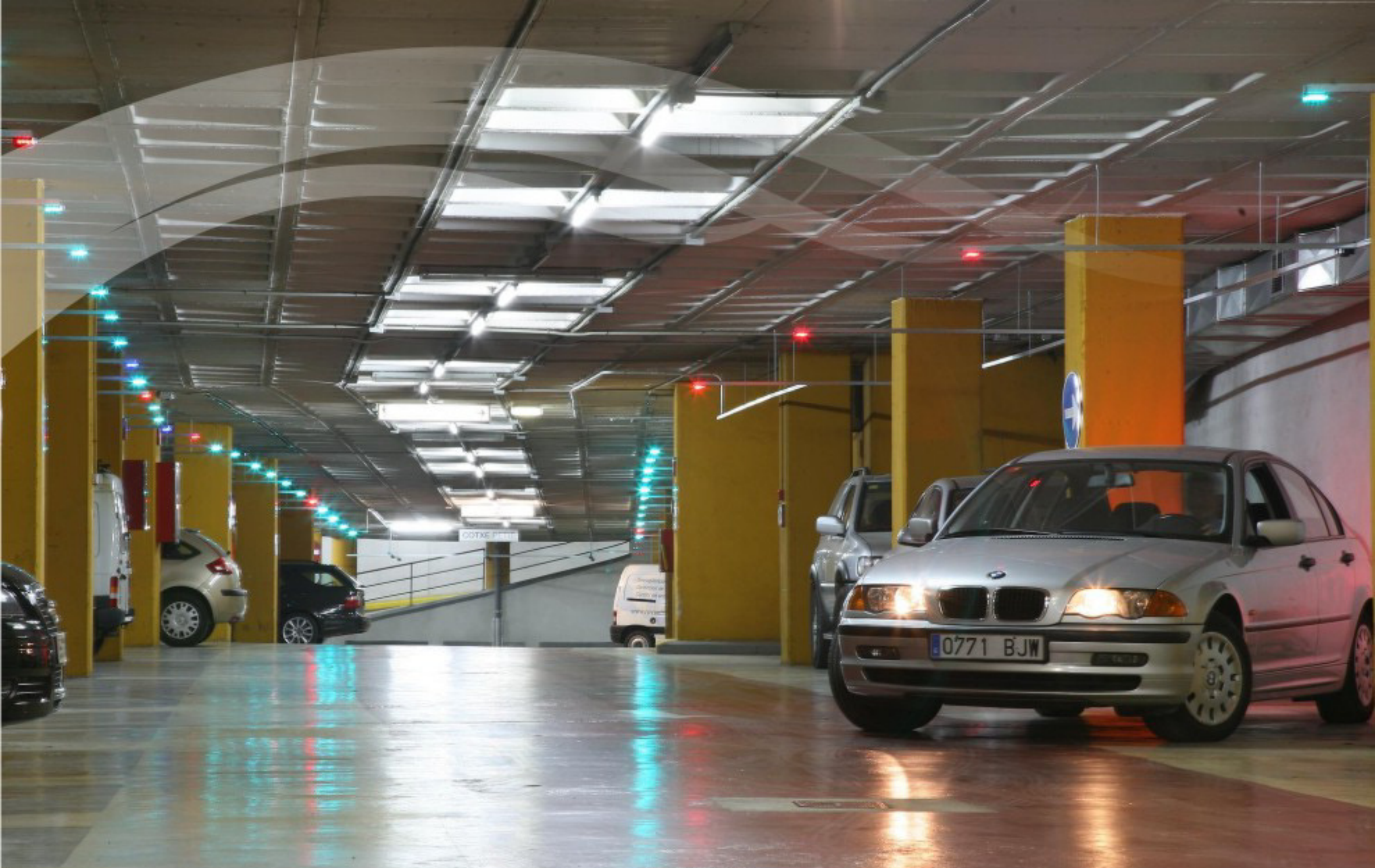
Comfortable car parking bays