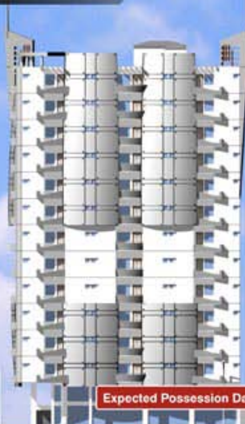
Euro Continental Tower