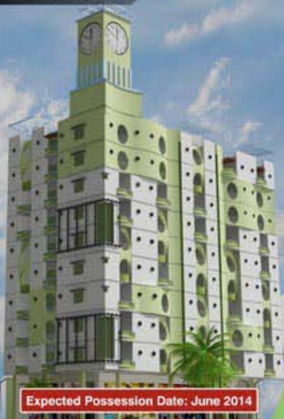
Euro Clock Tower