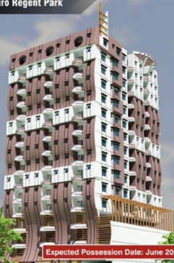
Euro Regent Park